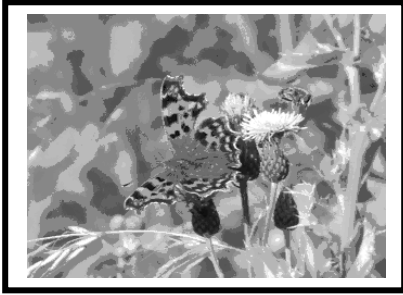
Comma, Flass Vale, 5.8.2012