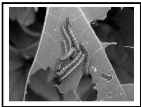
Caterpillars on Nasturtium