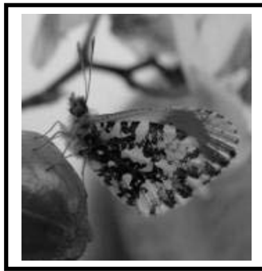
Male Orange Tip