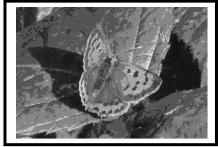
Small Copper, Flass Vale, 21.8.2012