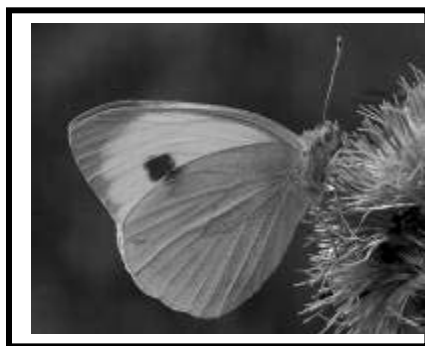
Adult Large White