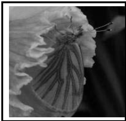
Green Veined White

Small and Large Whites there are two generations a year, with a spring and late summer generation. The caterpillars from the second generation feed into the autumn when they pupate to pass the winter.